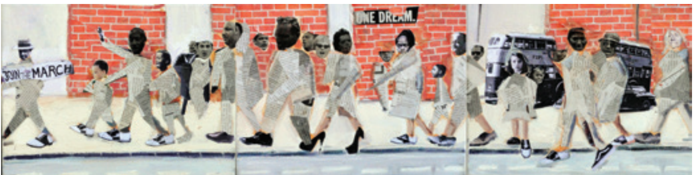
Steven McDonald, 'The Long March,' 2015, mixed media collage. 1st Place in Mixed Media.