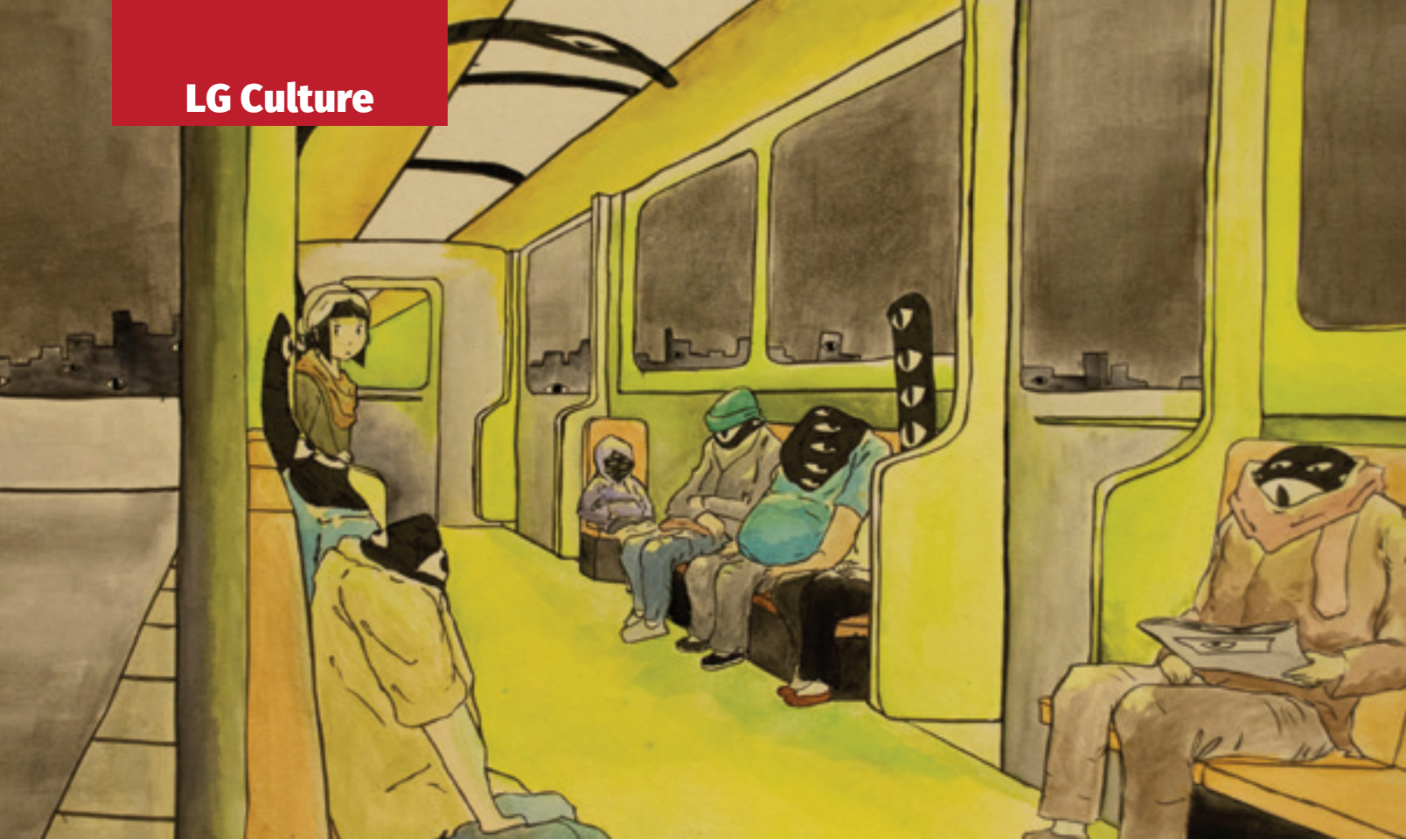
Jason Wu, 'Commute,' 2015, watercolor on illustration board. Judges' Recognition in Watercolor and Drawing.