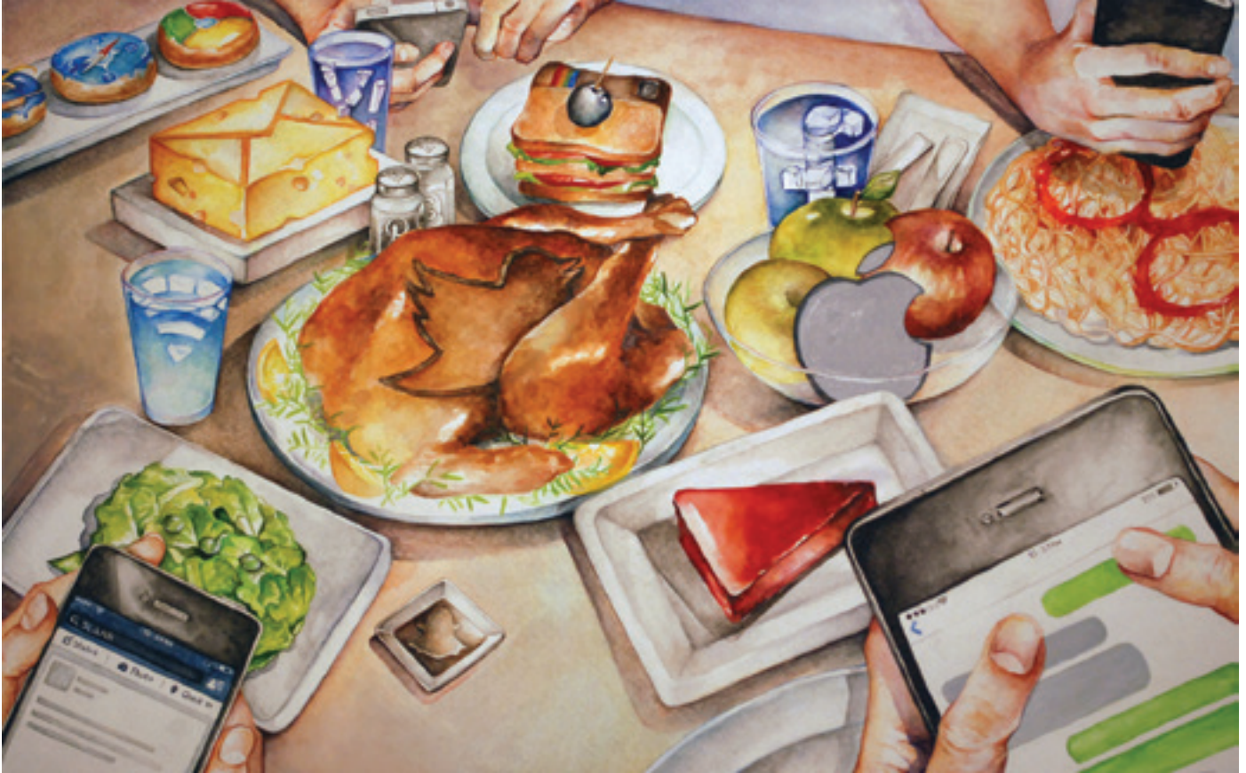
Jessica Yang, 'You Are What You Tweet,' 2015, watercolor. 1st Place in Watercolor and Drawing.

It asks students to communicate the symbolism, the expression of their piece as if they were a professional wanting to exhibit at a gallery. It is an invaluable experience.”